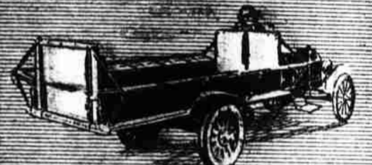
Flat Rack Body