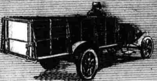
Grain Rack Body