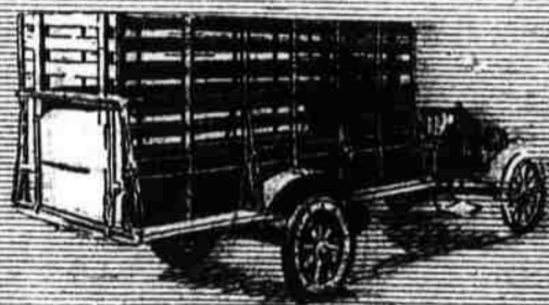
Stock Rack Body

Executive Offices and Salesroom: Suite 1010 Smith Form-a-Truck Building Chicago