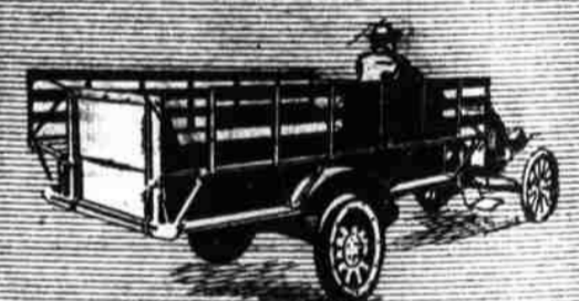
Basket Rack Body