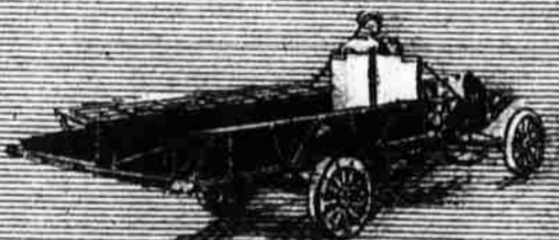
Flat Rack Body, Scoop Board Down