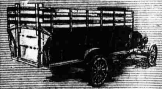
Rack Body for Hay, Straw, Loose Grain