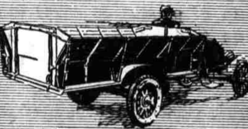
High Side Flare Board Body