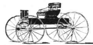
COLUMBIA RUN-ABOUT From $30 Up

Our Large Catalogue Is FREE. Write For it To-day.