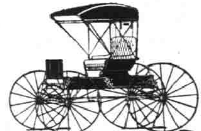
COLUMBIA SPECIAL, $33.75 Worth $20 More

A Few Styles Selected From Our Large Catalogue. Write for Prices on All Styles.