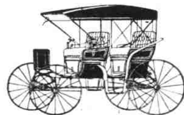
WINNER SURREY, $61.50 Rich in Design and Finish