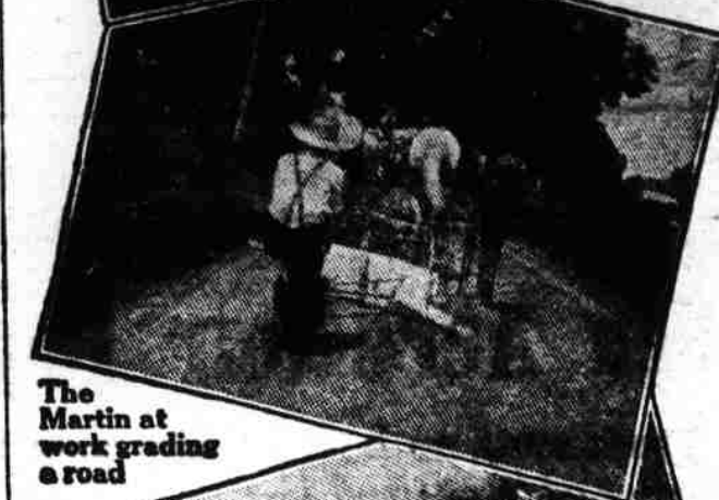
The Martin at work grading a road