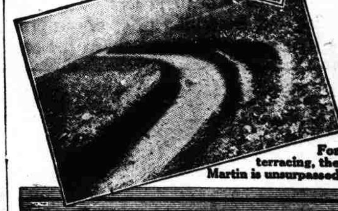
For terracing, the Martin is unsurpassed