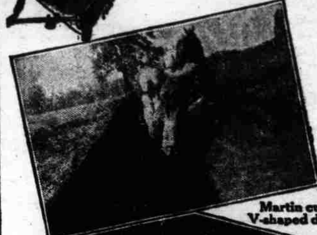
The Martin cuts a V-shaped ditch

Owensboro Ditcher & Grader Co., Inc. Box 831 Owensboro, Ky.