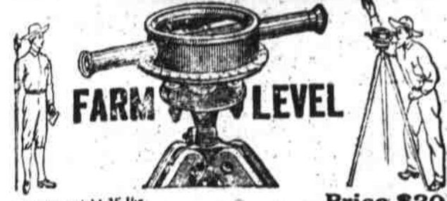
Shipping weight 15 lbs. Price $20

with TELESCOPE, as meeting every requirement for all such work. They say no land owner can afford to be without one, as it pays for itself on one job and lasts a lifetime. It is absolutely simple to operate, accurate, durable and complete, including Level, Telescope with magnifying glasses which enable you to see the cross on Target a quarter of a mile away, man size Tripod, Graduated Leveling Rod, Target, Plumb Bob and full instructions.