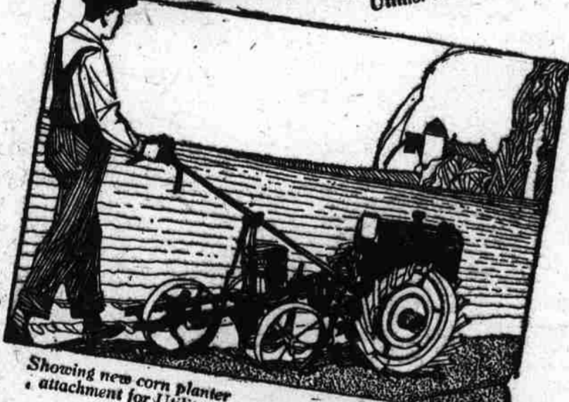
Showing new corn planter attachment for Utilitor