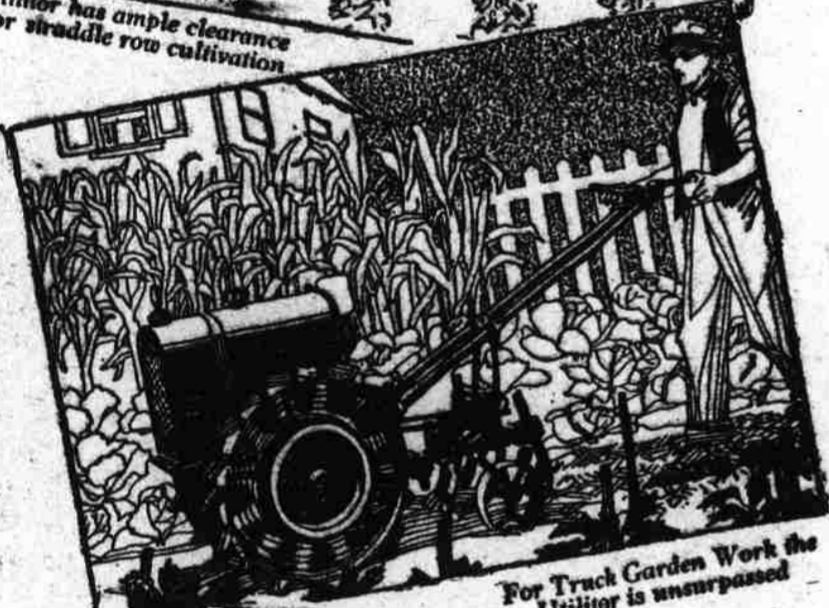
For Truck Garden Work the Utilitor is unsurpassed