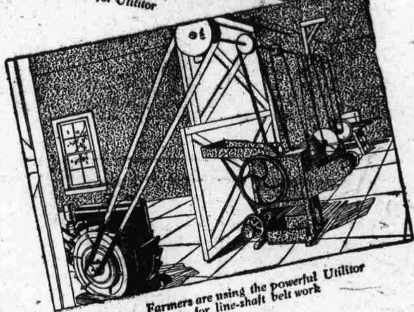
Farmers are using the powerful Utilitor for line-shaft belt work