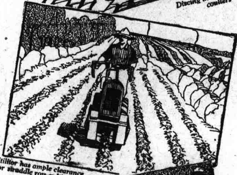
Utilitor has ample clearance for straddle row cultivation