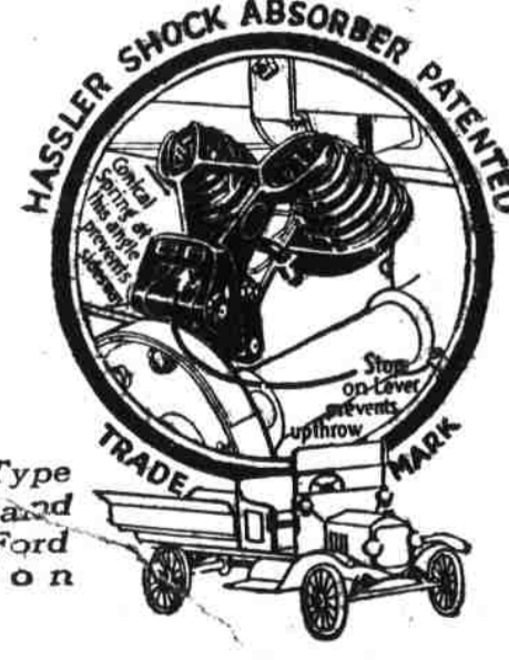
This Twin Type for Front and Rear of Ford One-Ton Trucks.