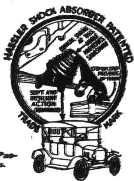
For Ford Passenger Cars.

A Standardized Quality Product—Worth the Price