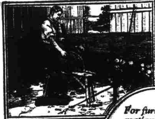
A portable motor drives the grindstone

to plow will produce some handsome profits this fall, I can tell you."