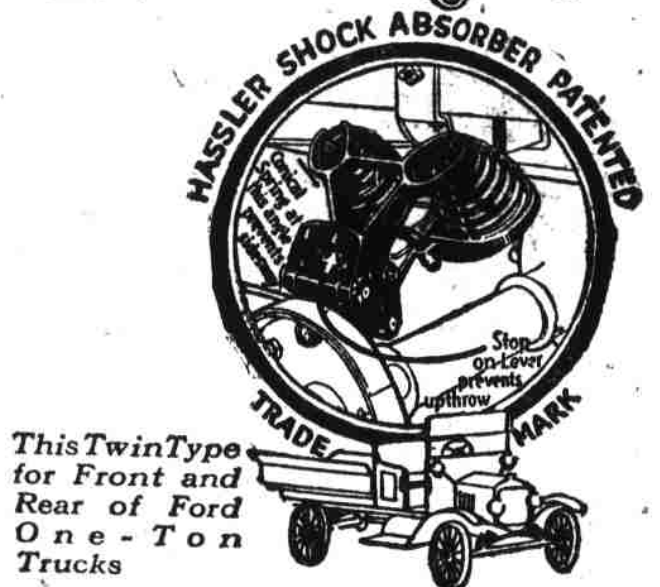
This TwinType for Front and Rear of Ford One-Ton Trucks

HASSLER TRADE MARK REGISTERED Shock Absorbers PATENTED for Ford Cars and Trucks