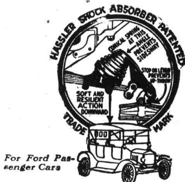
For Ford Passenger Cars

A Standardized Quality Product—Worth the Price