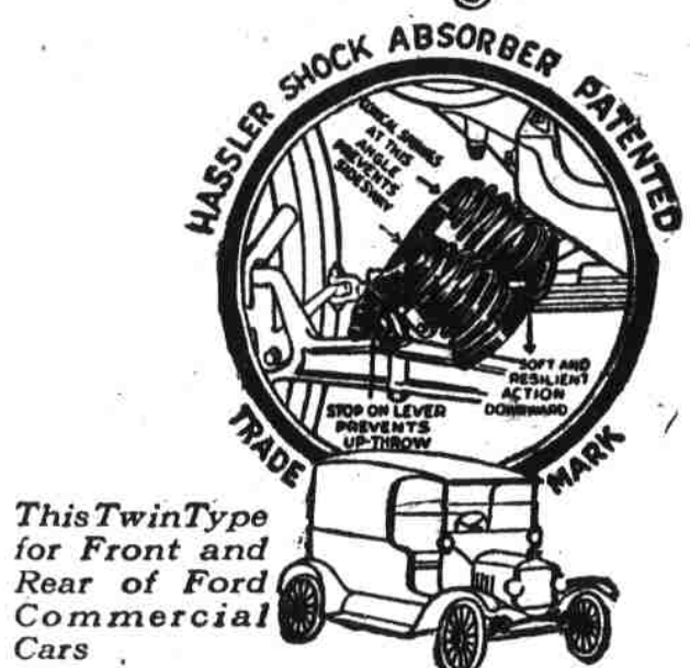
This TwinType for Front and Rear of Ford Commercial Cars