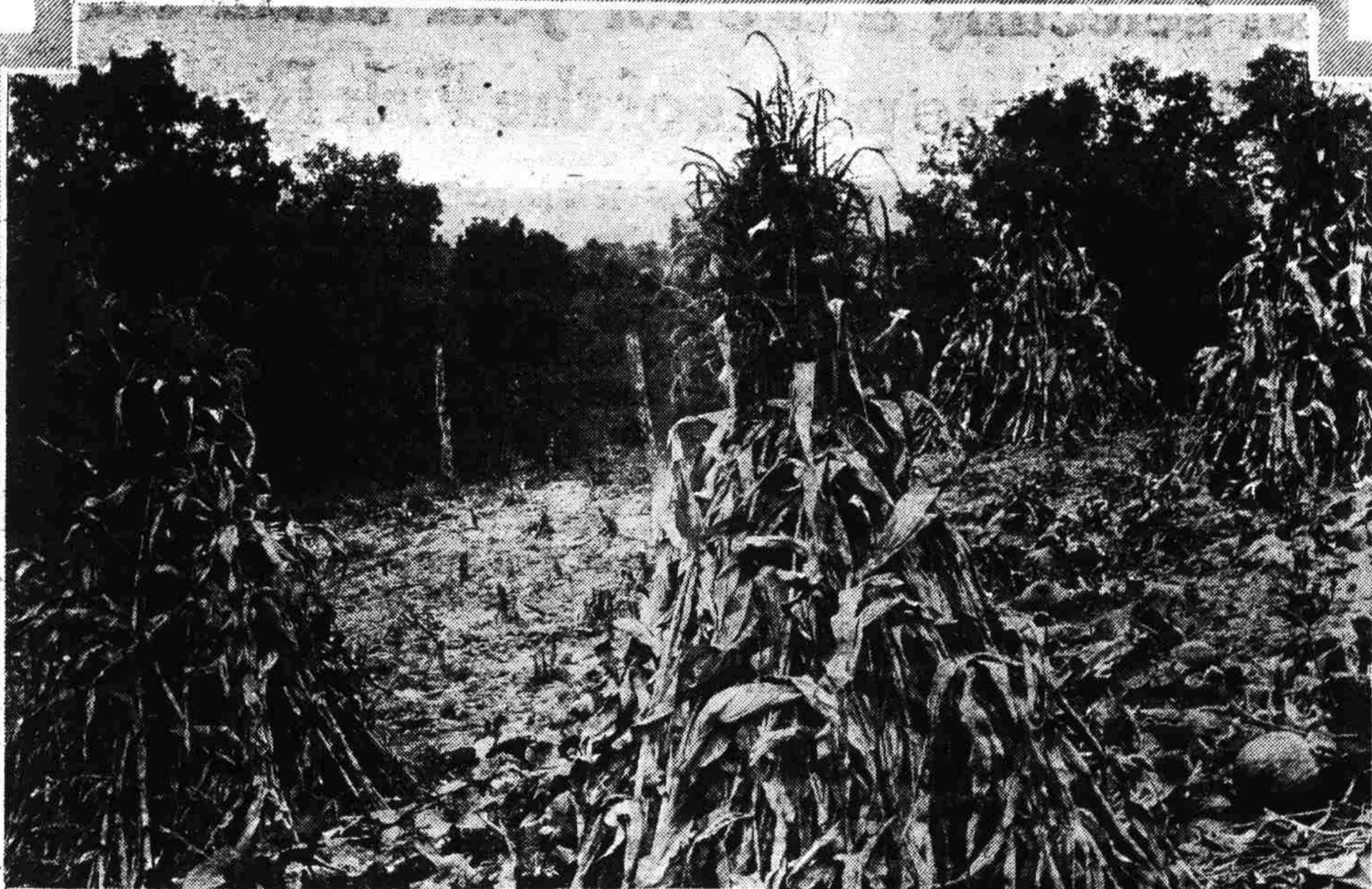
"OLD OCTOBER'S PURT NIGH GONE"