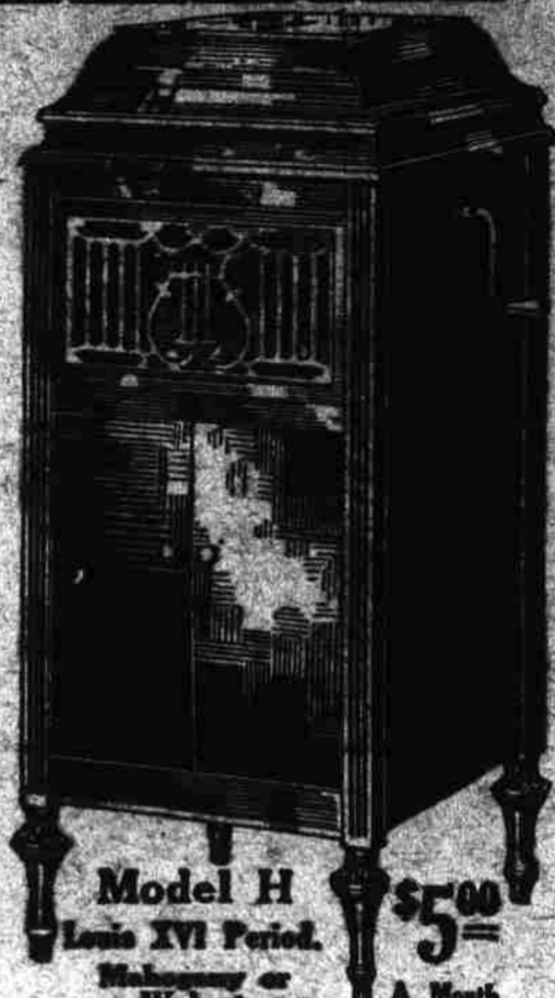
Model H Louis XVI Period. Mahogany or Walnut. A Month $5.00

Specifications: Height, 43 1/2 inches; width, 20 inches; depth, 22 inches. Net weight, ready to play, about 75 pounds. Price, $135.00, payable $5.00 a month.