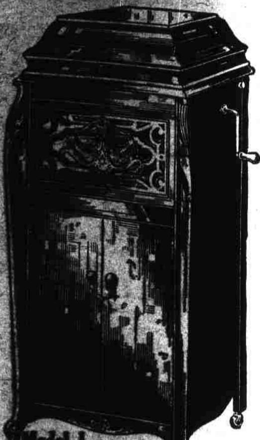
Model J Louis XV Period. Mahogany, Walnut or Fumed Oak. Gold Plated Metal Parts. A Month $6.00

Specifications: Height, 43 1/2 inches; width, 20 inches; depth, 22 inches. Net weight, ready to play, about 75 pounds. Price, $135.00, payable $5.00 a month.