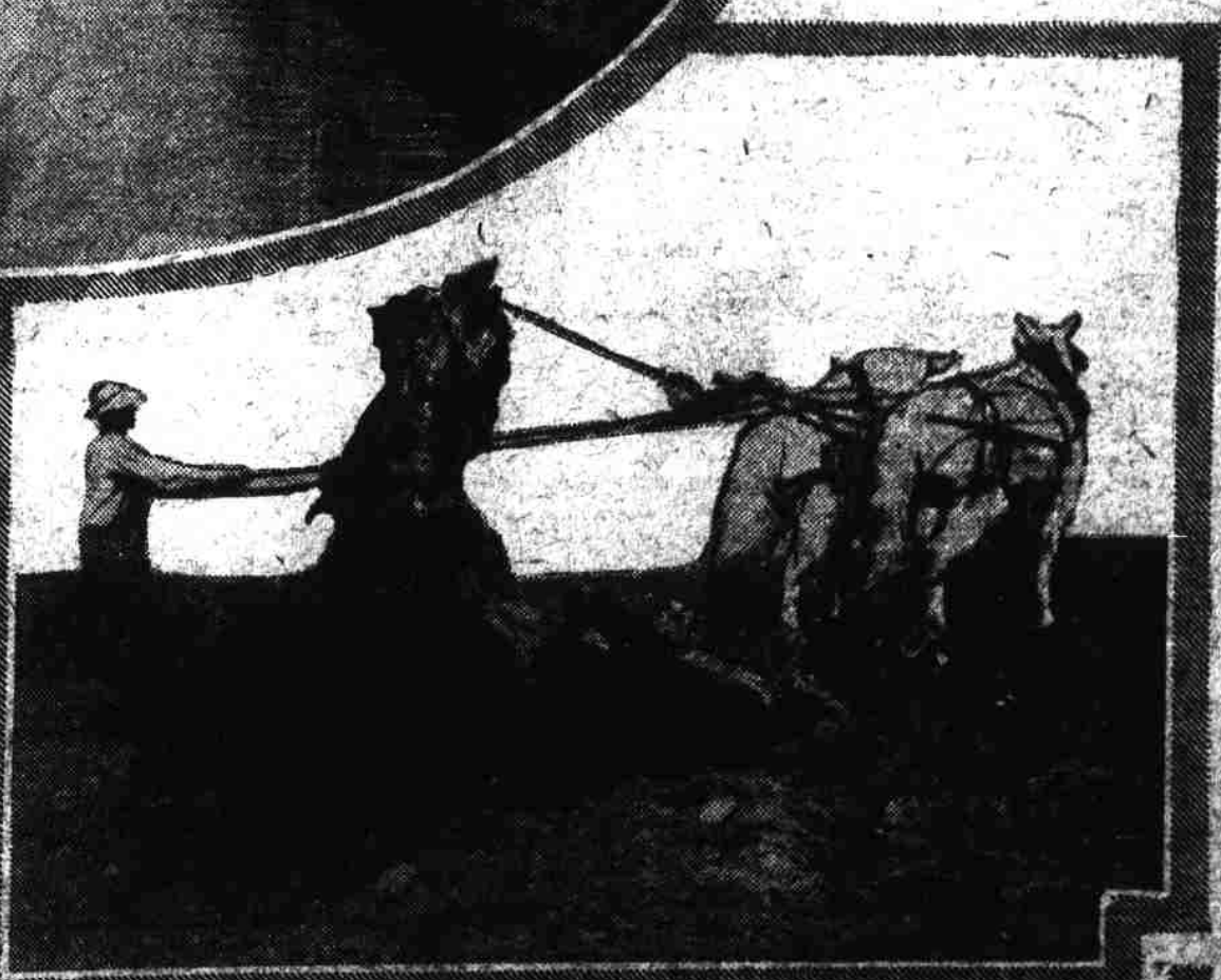
EXTRACTION—THIS IS THE REMEDY

SOIL protection has become a duty—not a choice. A country worth fighting for is too good to let wash from under foot. Reclaiming waste land by drainage and clearing are important to individual farmers and to communities, for this new land will bring them greater prosperity. Protecting soil by terracing is on a broader scale. It is just as important to the individual and