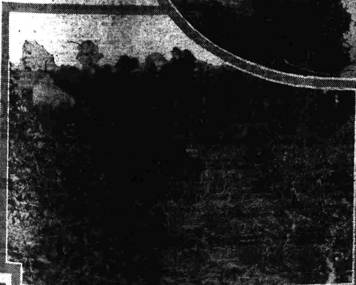
A STUMP, LIKE A BAD TOOTH, BREEDS TROUBLE

SOIL protection has become a duty—not a choice. A country worth fighting for is too good to let wash from under foot. Reclaiming waste land by drainage and clearing are important to individual farmers and to communities, for this new land will bring them greater prosperity. Protecting soil by terracing is on a broader scale. It is just as important to the individual and