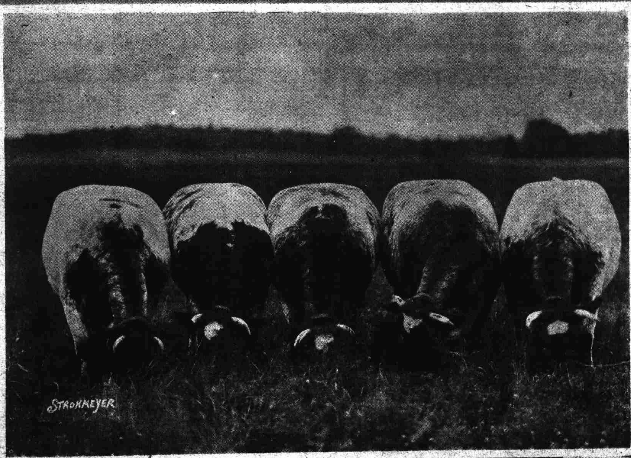
ANIMALS LIKE THESE TAKE THE STALKS AND THE FODDER AND THE GRASS AND MANY THINGS THAT WOULD GO TO WASTE AND PUT THEM IN A FINE PACKAGE READY FOR MARKET