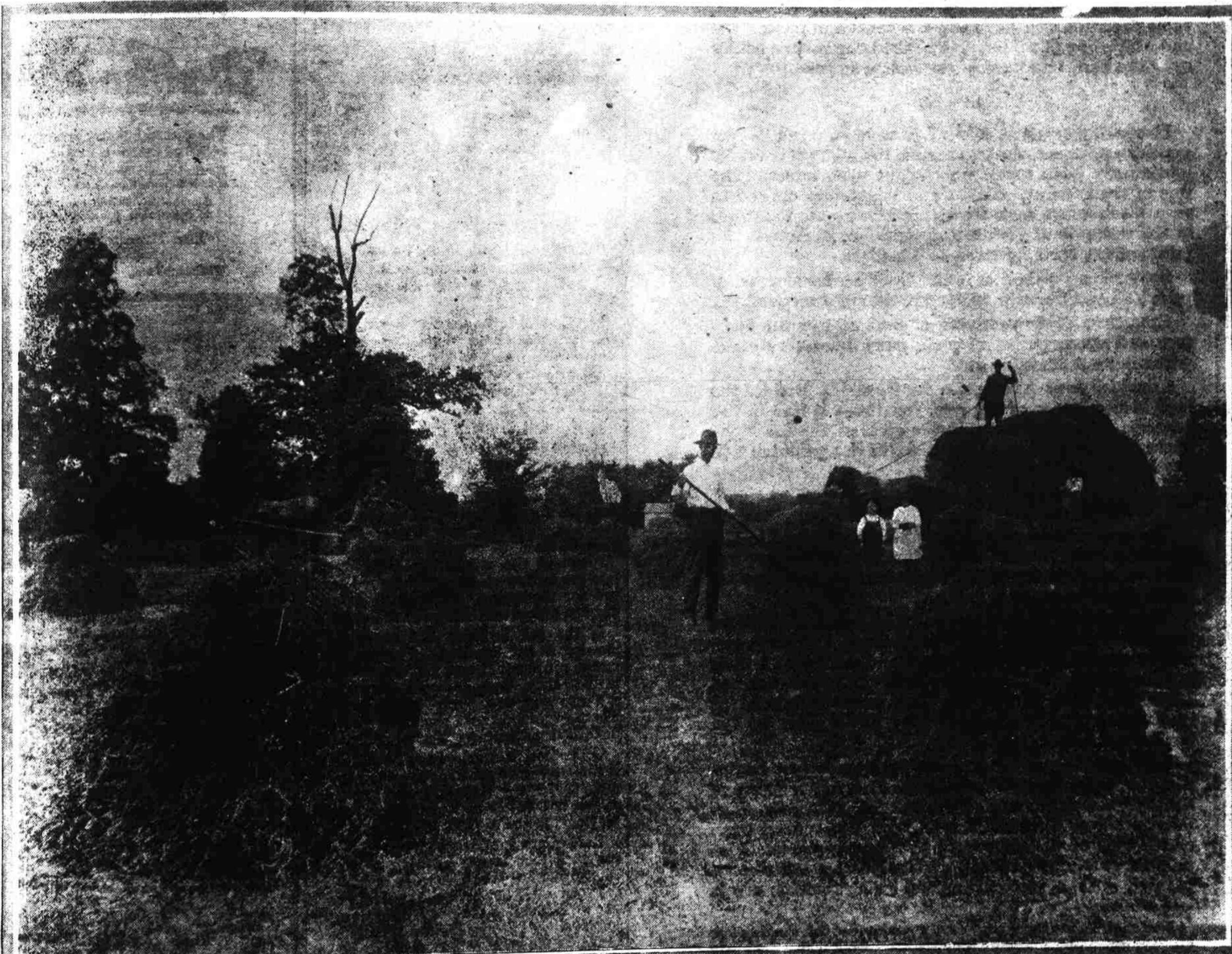
A FINE FIRST CUTTING OF SPRING-SEEDED ALFALFA ON THE FARM OF H. A. AND H. E. NEWTON, FRANKLIN COUNTY, N. C. As a rule fall seeding of alfalfa is considered desirable except for the occasional very dry fall. Where land is well prepared Southern farmers have had good results from spring seeding. Now is the time.