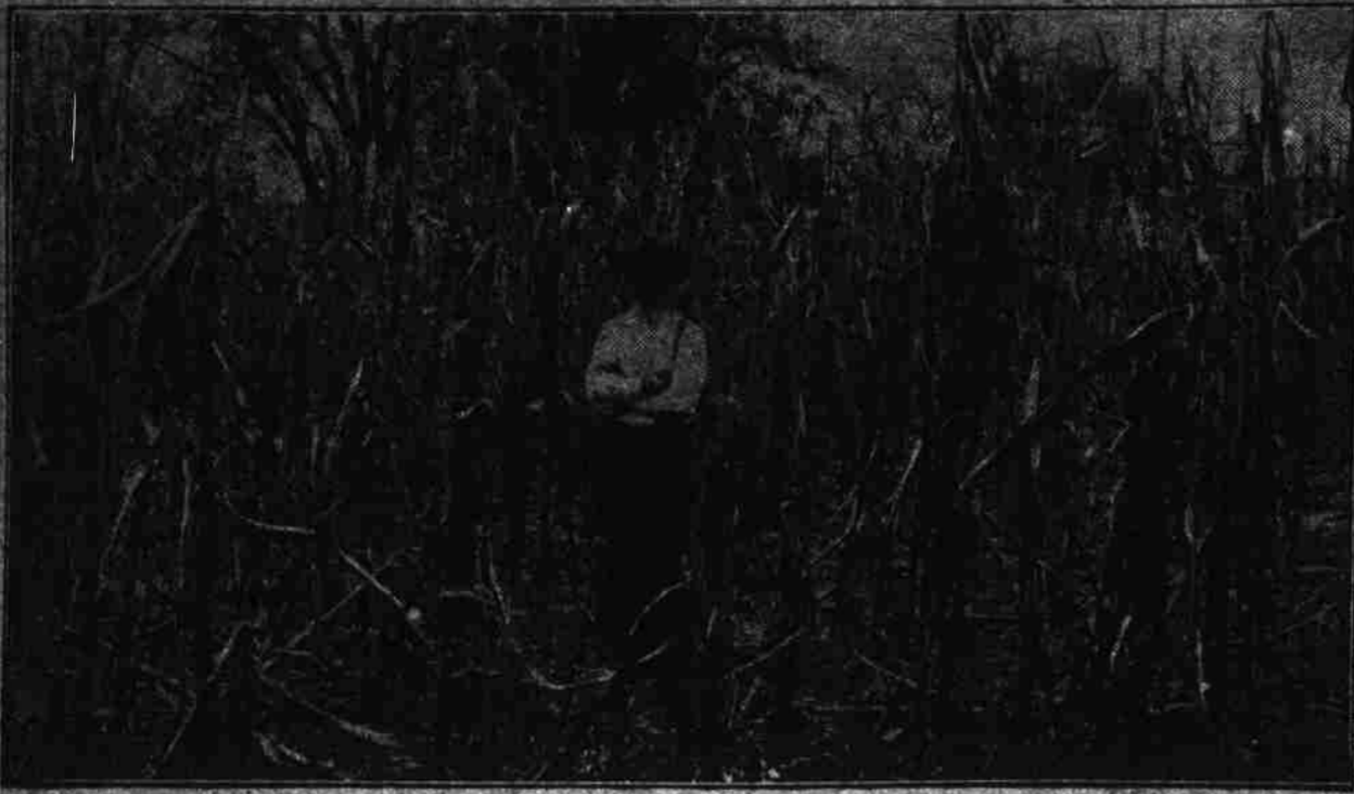
A Virginia Corn Field after a Hail Storm