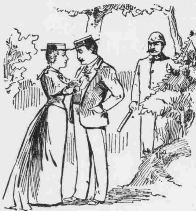
SHE PLACED THEM IN THE LAPEL OF HIS COAT.

He had remained there only a few minutes when along came a young