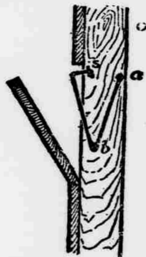
Handy Manger Device.

When the cows or horses are fed through a hole which is closed by a door opening downward it often happens that this door will not open of its own accord. This necessitates some delay, and often the use of both hands. I once had a mare that would open the feeding door with her nose whenever she heard the button turn which held the door shut, says a writer in the Farm and Home. This helped me so much that I arranged a spring wire device to open the doors in front of the other horses. The accompanying cut shows the arrange-