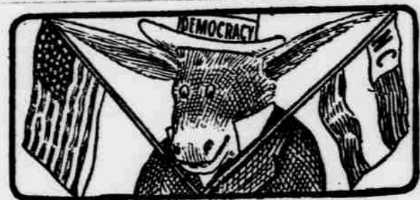
OXFORD, N. C., SATURDAY, MARCH 23rd, 1912

Reading notices 5c per type line each insertion. DID YOU KNOW that the Public Ledger with its 2,500 subscribers offers the best advertising medium between the seller and the buyer in this territory.