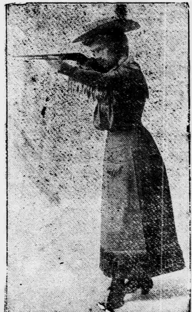
Annie Oakley, holder of the Title of Champion Rifle and Wing Shot of the World. Young Buffalo Bill Wild West Show Oxford, Saturday, Sept. 20th.