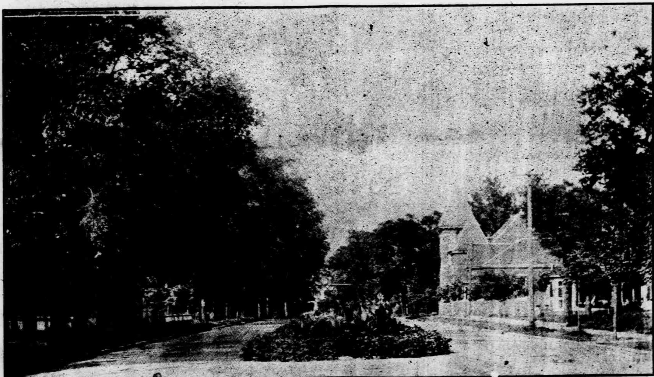
SPRING STREET LOOKING WEST