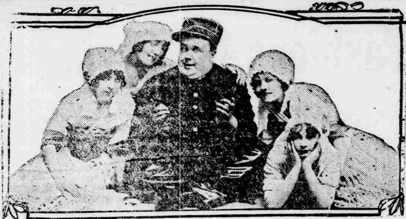
Scene from "The Million Dollar Doll" to be shown at the Orpheum Theatre Thursday night, March 21st.