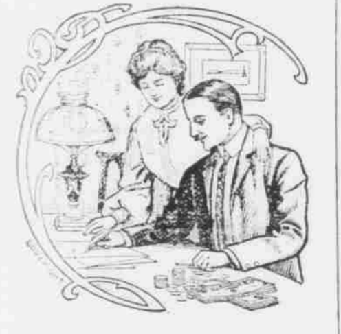
FIGURE IT OUT YOURSELF

But you will soon see that by putting by just of your earnings in