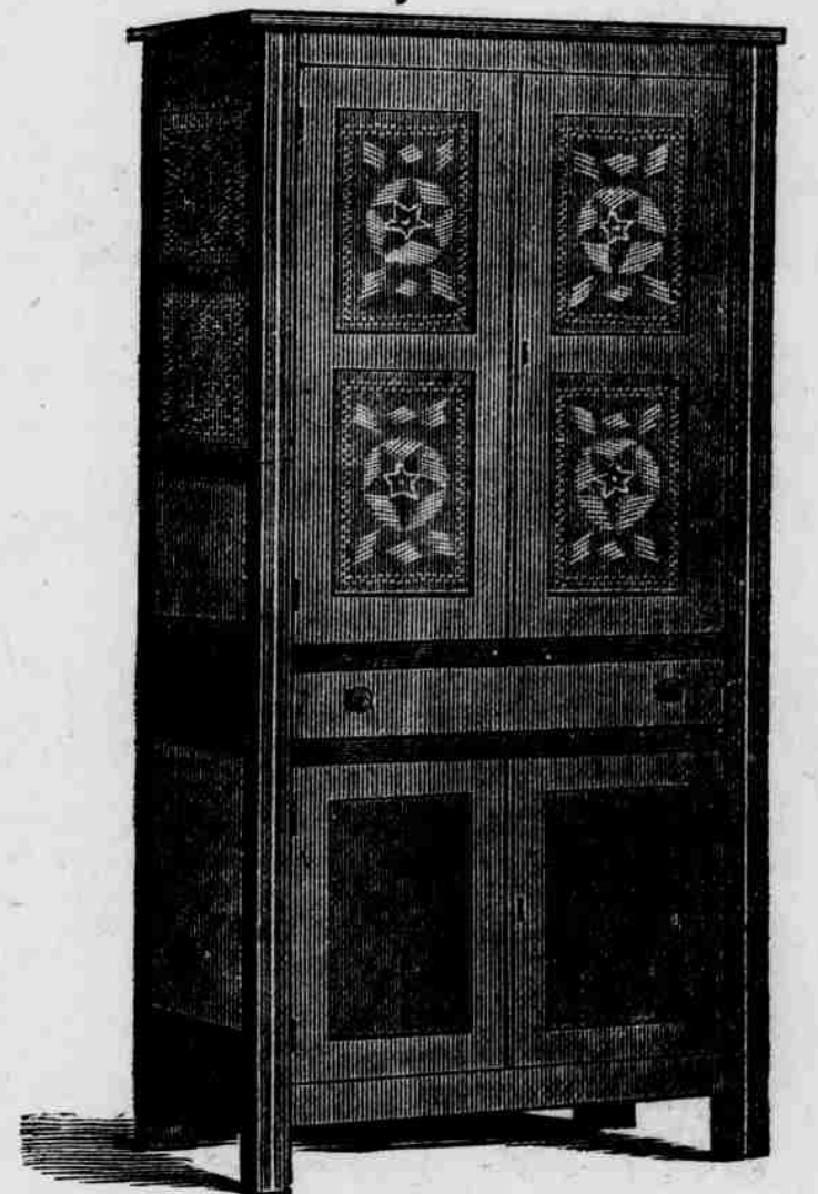
From $3.50 up.