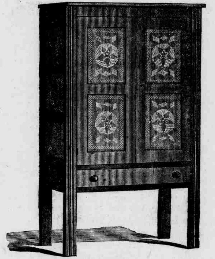
From $2.00 up.

Bed Springs from $1.35 up. Mattresses from $1.25 to $15.00. Hall Racks from $3.50 to $40. Sideboards from 8.00 up.