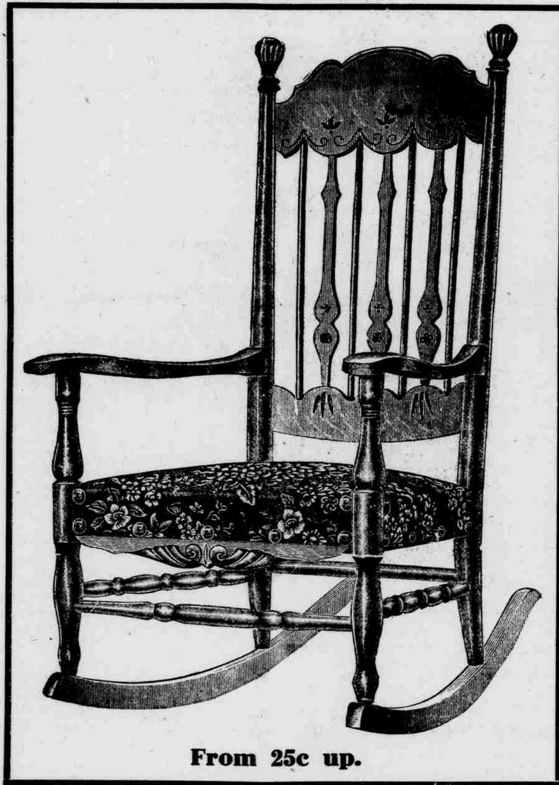
From 25c up.

Bed Springs from $1.35 up. Mattresses from $1.25 to $15.00. Hall Racks from $3.50 to $40. Sideboards from 8.00 up.