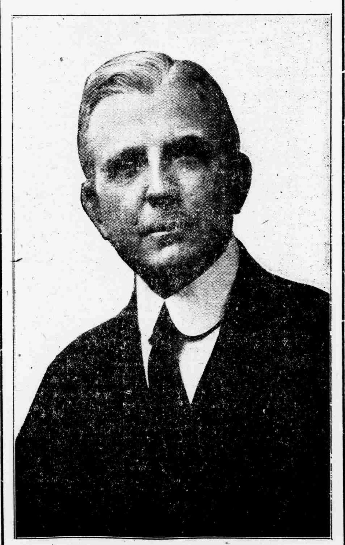
HON. CAMERON MORRISON (Leading in the Contest for Governor.)