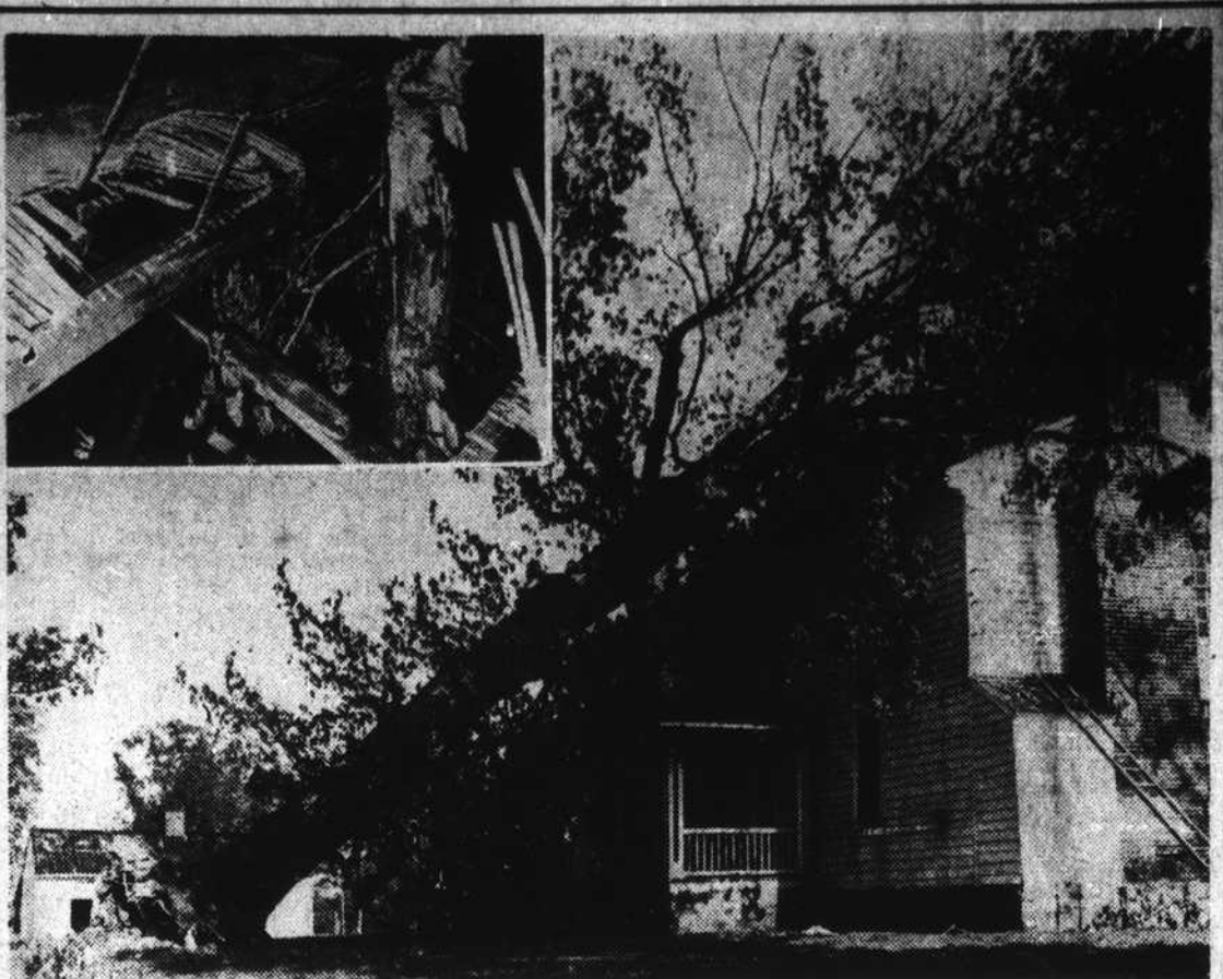
The Above Dwelling Was Covered by Insurance—Extended Coverage—Written by Our Agency