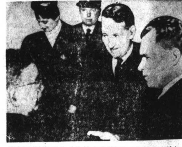
VICE PRESIDENT Richard M. Nixon (right) is greeted by Austrian Foreign Minister Leopold Figl (left) and U.S. Ambassador Llewellyn E. Thompson on his arrival in Vienna. Nixon came to Austria to explore the possibility of increasing America's contribution to the Hungarian refugee rehabilitation program. He indicated that the U. S. may allow more than 21,000 refugees to enter the country as victims of Red terror in Hungary.