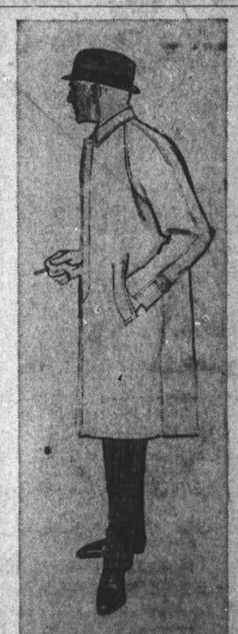
The 3RD BARRIER

Pamlico is a large fruited, light green variety of good flavor and attractive appearance. The fruit ripens about a week earlier than Dearing. The vine is vigorous, productive and has good foliage. Pamlico is superior to Willard and Wallace in flavor, fruit size, soluble solids, vigor and disease resistance.