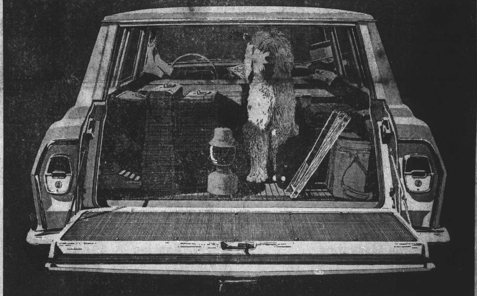
Chevy II Nova 400 6-Passenger Station Wagon

Fish frozen about 1,100 years ago have been found in Antarctica's Ross Ice Shelf, the National Geographic Magazine says. The specimens were in a remarkable state of preservation.