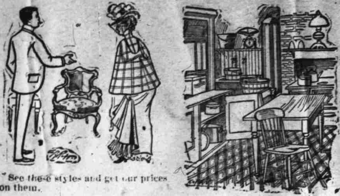
See these styles and get our prices on them.