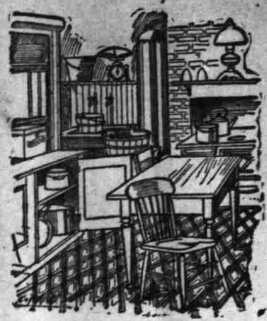
We call special attention to our