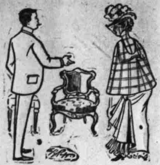
See these styles and get our prices on them.