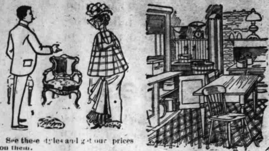
See these styles and get our prices on them.