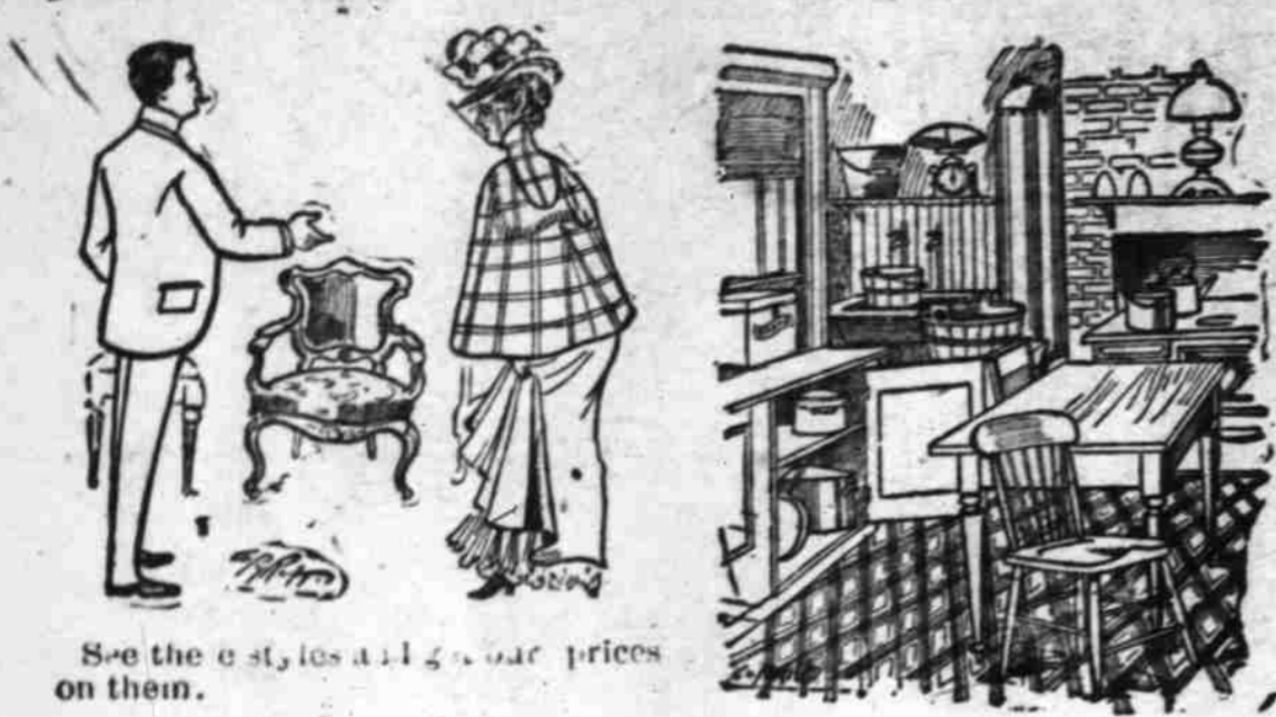
See the styles and our prices on them.