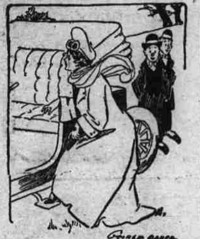
Jinks—Does Mrs. Speedem carry an extensive repair kit when she goes out-trotting? Blings—No; merely a paper of safety-pins.