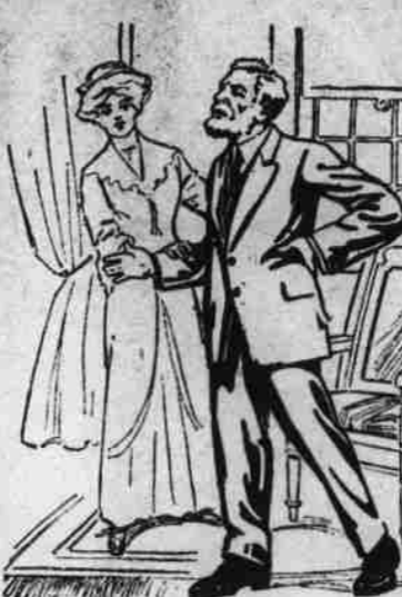
"Every Picture Tells a Story"

Doan's Kidney Pills are the best recommended and most widely used remedy for weak or diseased kidneys. They act quickly: contain no poisonous nor habit-forming drugs and leave no bad after-effects of any kind—just make you feel better all over.