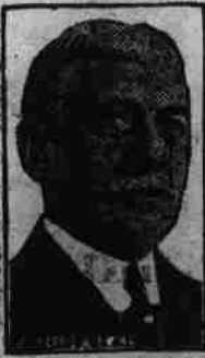
Hon. Elihu Root On Woman's Sphere

The question of Woman Suffrage is an issue before the American people. Twelve states have adopted it, four more states vote upon it this fall and it is strongly urged that it become a platform demand of the national political parties. It is therefore the privilege and the duty of every voter to study carefully this subject. Hon. Elihu Root, in discussing this question before the constitutional convention of New York, recently said in part: