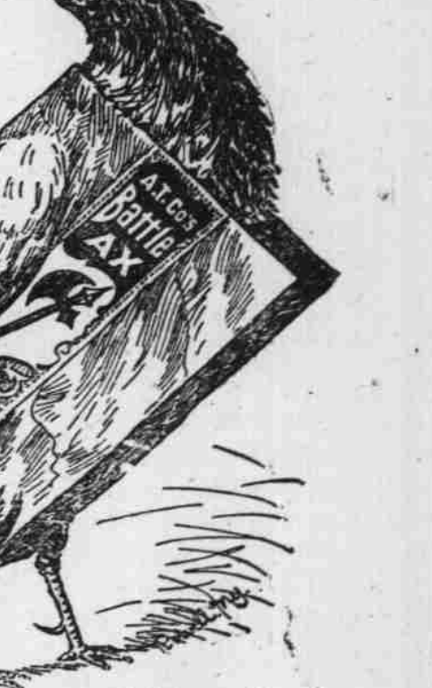
"Something to Crow About."

Is the One True Blood Purifier. All druggists. Prepared only by C. I. Hood & Co., Lowell, Mass. Hood's Pills act easily, promptly and effectively. 25 cents.