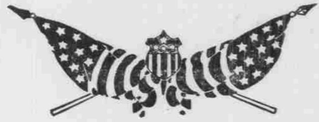
"My Country 'Tis of Thee, Sweet Land of Liberty."

Matter sent to The Warren Record for publication must bear the writer's name and address; not necessarily for publication. Please Address All Correspondence to The Record Printing Co., Warrenton.