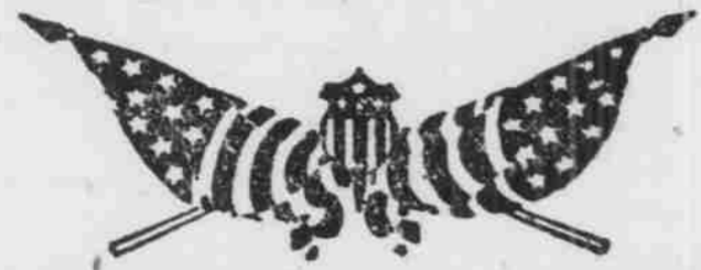
"My Country 'Tis of Thee, Sweet Land of Liberty."

Matter sent to The Warren Record for publication must bear the writer's name and address; not necessarily for publication. Please Address All Correspondence to The Record Printing Co., Warrenton.