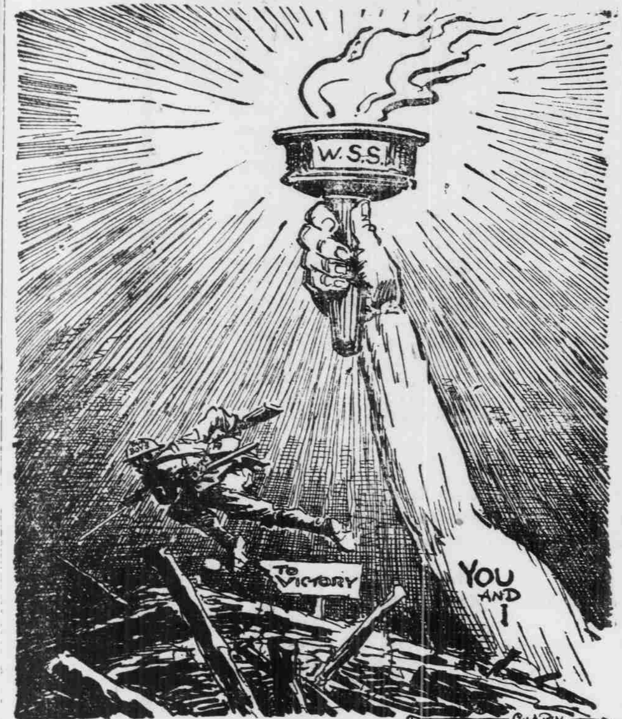
W. S. S. TAKE THE BOYS "OVER THE TOP"

President Wilson Proclaims June 28 National War Savings Day.—Governor Bickett Designates June 23-28 War Savings Week.—Every Person Will Be Asked to Pledge.