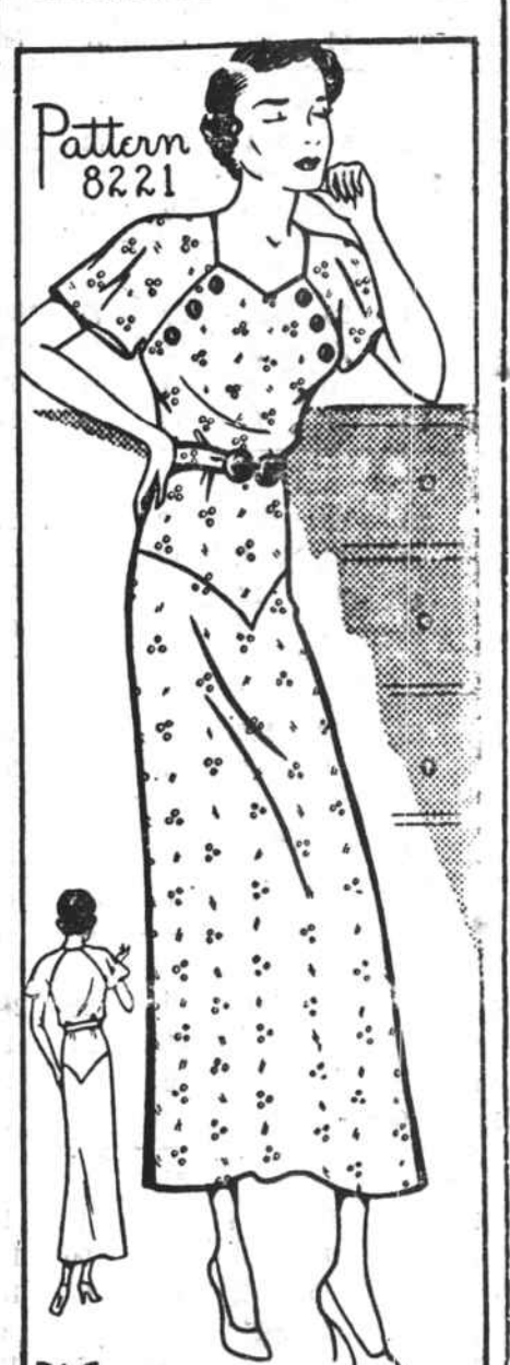
Designed in Sizes: 34, 36, 38, 40, 42 and 44. Size 38 requires 3 1/2 yards of 35 inch material.