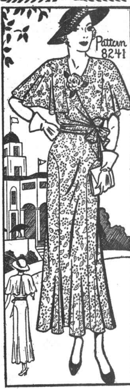
Designed in Sizes: 36, 38, 40, 42, 44, 46, 48, 50 and 52. Size 44 requires 5 yards of 39 inch material.

For PATTERN, send 15 cents in coin (for each pattern desired) your NAME, ADDRESS, STYLE NUMBER and SIZE to Patricia Dow, Warren Record Pattern Dept., 115 Fifth Avenue, Brooklyn, N. Y.