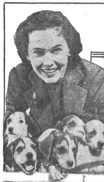
LOS ANGELES... The mother of these Missouri hound quin-puplets was brought here for a fox hunting scene in a movie. Being five, they were named after the Dionne quin- tuplets and shipped to the famous Canadian sisters for Christmas.

The home was attractive in Christ- mas evergreens. A silver and blue color scheme was carried out in the dining room, where blue tap- pers burned in silver holders.