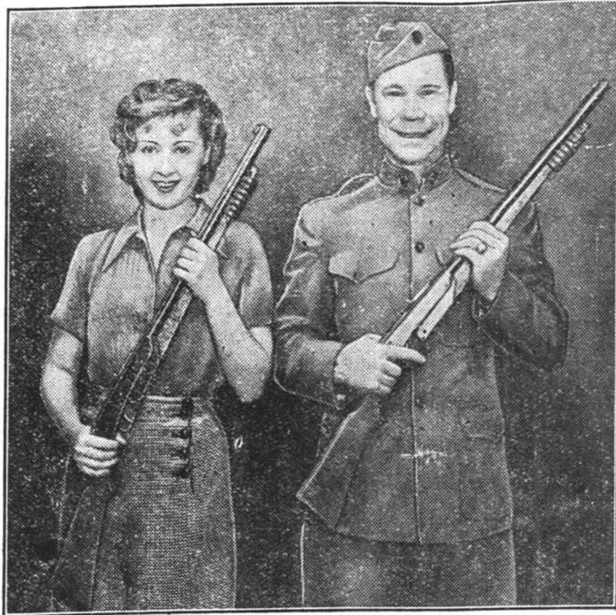
Joan Blondell Joe E. Brown

A MONG the first to take up the new Hollywood pastime of air rifle shooting were Joan Blondell and Joe E. Brown. And do they enjoy it? Well, just look at those smiles, including the one of Mr. Brown's!