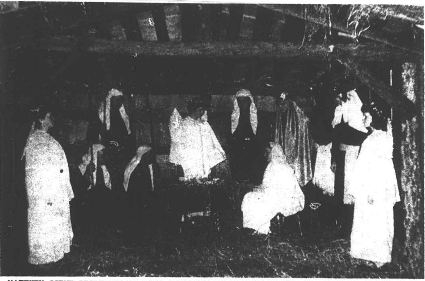
NATIVITY SCENE RECREATED IN MANY CHURCHES IN WARREN COUNTY AS CHRISTMAS DRAWS NEAR The Birth Of Christ Is Enacted By Members Of The Warren Plains Baptist Church On Sunday Night