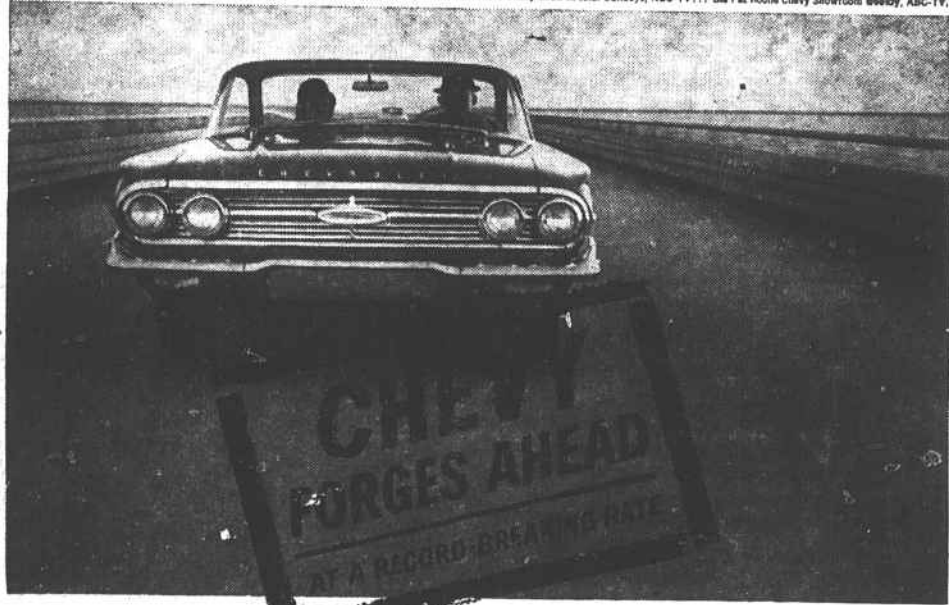
Impala Sport Coupe — one of Chevy's 18 fresh-minted models for '60. See The Dinah Shore Chevy Show in color Sundays, NBC-TV... the Pat Boone Chevy Showroom weekly, ABC-TV.

Factories are turning out more new Chevrolets every day. More proud new Chevy owners taking to the road. Now's the time to see your dealer for fast delivery and a favorable deal!