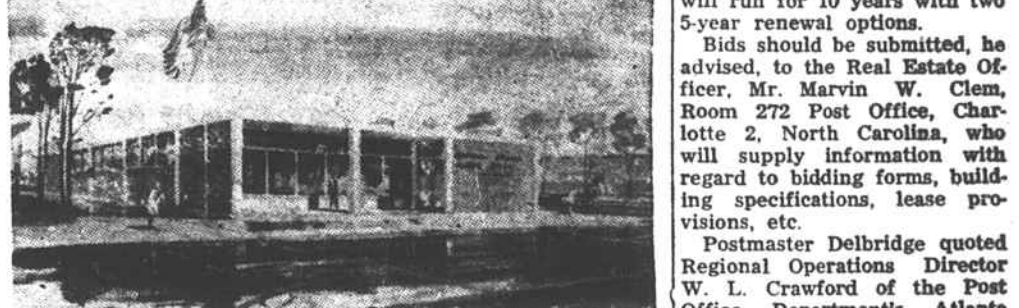
ARCHITECT'S SKETCH OF PROPOSED POSTOFFICE