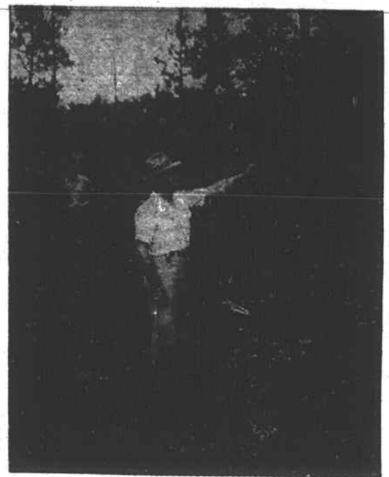
All that can be said here is that I waited too long to get in line.