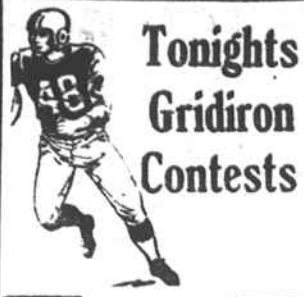
Tonights Gridiron Contests

Weldon, a team which likes to run the ball a lot, but which