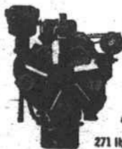
4-55 Diesel 230 hp; 271 lbs.-ft torque

that let drivers see up to 10 1/2 feet more of the road directly ahead. Like Chevrolet's proved independent Front Suspension for even smoother riding, easier working trucks. Like the heavier duty hypoid rear axles for middleweights and the rugged new I-beam front axles* (9,000- or 11,000-lb. capacity) available for extra-tough jobs on Series 80 heavyweights. Like the longer lived mufflers. Like work-proved Corvair 95's (2 pickups and a panel) that haul up to 1,900 lbs. of payload with low-cost dependability and sure rear-engine traction. Like to know more? See your Chevrolet dealer.