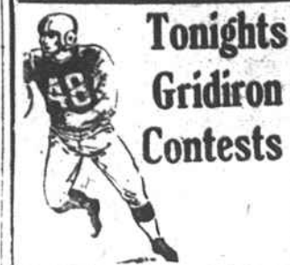
Tonights Gridiron Contests