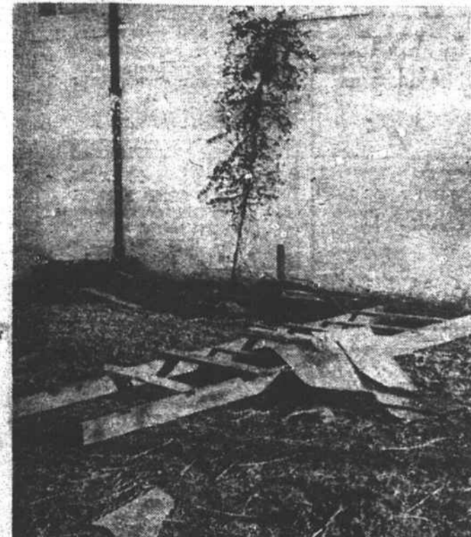
The window in the above picture, middle photo, is some ten or more feet from the ground. It was reached by ladder shown in bottom picture.