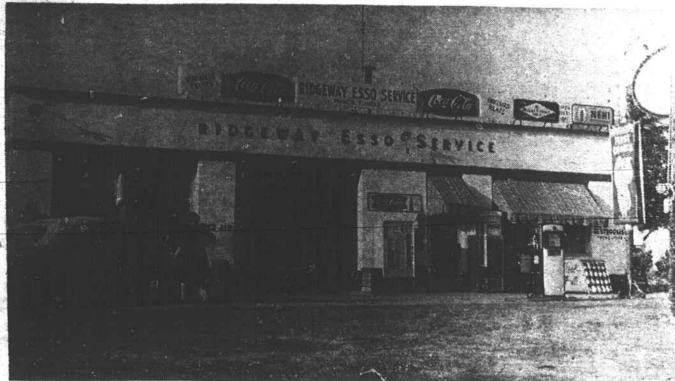
INGLE SERVICE STATION