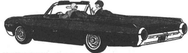
LUXURY UNLIMITED . . . This is Thunderbird—unique in all the world. First of the trim-size luxury cars, Thunderbird is for the man who insists on the ultimate—in luxury, in performance, in distinction. Four gleaming editions: Landau, Hardtop, Convertible, Sports Roadster.

Buyer's guide to America's most complete car selection!