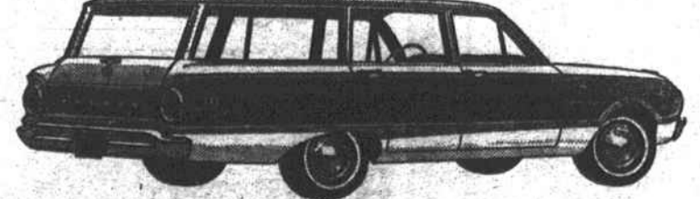
THIRTEEN WAGONS FROM AMERICA'S STATION WAGON SPECIALISTS . . . The finest wagon collection assembled under one roof. Five full-sized Ford wagons . . . and eight Falcons, including three big, new Club Wagons that are priced below many standard compact wagons.

Whatever you're looking for in a car, look to the long Ford line. These are the cars with the features of the future that put you years ahead now... dollars ahead when you trade!