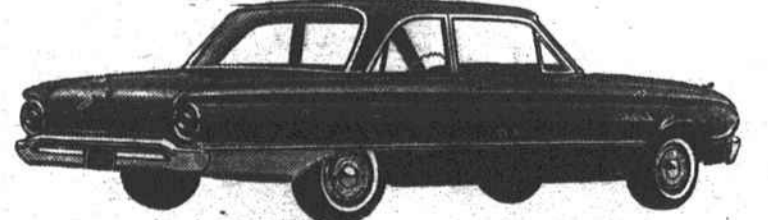
AMERICA'S BEST SELLING COMPACT . . . Its name is Falcon—and it's the lowest-priced* six-passenger car on the American road. There are five models, exclusive of wagons. Choose the new 170 Special Six engine, or improved version of the Six that broke all records in the '61 Mobilgas Economy Run. *Based on a comparison of manufacturers' suggested retail delivered prices, including taxes.